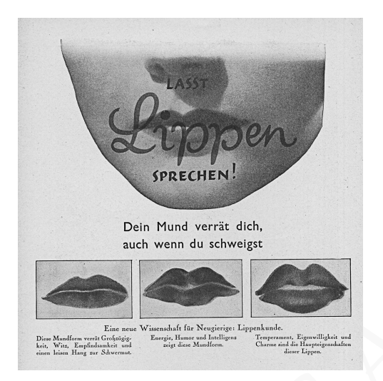
Figure I.2 "Let Lips Speak! Your Mouth Gives You Away, Even if You Remain Silent." Uhu , April 1933.

called upon—whole or in parts—to stand as indicative of people, the legacy of the First World War was that they could also be acted upon and changed.<sup>4</sup> The type of insight shown in these print images was not restricted to esoteric scholars or art snobs. As part of the preoccupation with physicality that was a defining characteristic of modernity, information about training and watching bodies was purchase-able in affordable booklets and reiterated on the pages of popular magazines. And it changed how people made and understood dance, because such capacities did not disappear when entering a studio or theatre. In this time and place, the specially cultivated bodies of theatrical dance were viewed as human bodies whose physicality shaped their meaning in ways that were intentional and inadvertent, products of production and reception, albeit sometimes differently. Although many Weimar dance spectators whose commentaries remain were at most amateurs in the genre, they brought to their task a different kind of expertise: the capacity to make their own sense from the bodies they saw on stage in a manner that situated concert halls and cabaret stages in dialogical relation to everything that surrounded them.