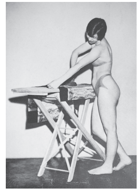
Figure I.3 Bess Mensendieck's It's Up to You (1931) shows a woman ironing dressed and undressed with incorrect (this page) and correct (facing page) posture.

daily lives. 70 The second factor, then, to consider is that choreographers and audiences shared an understanding that human physicality possessed a unique capacity for both exposing and changing the self. Manifesting in the form of heterogeneous practices that emphasized exercise, nudity, nature, and sunlight as means to change the body, and thus the whole person, the most consistent characteristic across the specifically German physical culture movements that peaked between 1890 and 1936 was their situation of bodies as simultaneously both authentic—sites to reckon with truth—and manipulable—sites of work. Prized for their beauty, honesty, and functionality, bodies were created rather than innate, as indicated in Fischer's introduction to a 1928 book on the subject: "Above all, physical beauty is the harmony, which the body demonstrates in fully developed movement; to create this beauty of movement is known as body culture."71 What is striking about this formulation is how bodies were not conceived statically but, rather, in motion and thus their potential emerged through active cultivation. From a performance standpoint, then, there is not so strict a distinction between the cool body of Neue Sachlichkeit and the ecstatic body that has been identified with expressionistic practices, both of which were lived and yet cultivated and therefore alterable.<sup>72</sup>