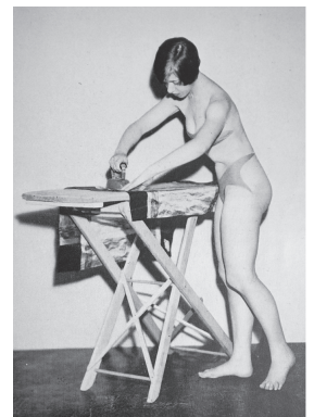
Figure I.3 continued

message."<sup>73</sup> They imply, as do so many texts of this period, that all this woman needed in order to change her personality was to change her physicality. If she was "negligent" when she did not use perfect posture, it is noteworthy that a few physical exercises were all this woman needed to amend that constitutive flaw.<sup>74</sup> Amid what Helmut Lethen calls a "classification mania,"<sup>75</sup> such physical typology empowered the general population to "read" aspects of physicality, as visible in Mensendieck's negligent woman or the article on lip shape, which in fact used the German verb lesen . However, these examples also show how body culture offered a means to develop the self, already functioning by the turn of the century as what Michael Cowan calls a kind of "performative therapy."<sup>76</sup> By the Weimar Republic, the combination of physical awareness and movement analysis available to audiences in a larger public sphere suggested that bodies not only embodied modernity but also actively enacted it by choosing their own physiques and thus their identities, a skill easily transferrable to the staging and spectatorship of dancing bodies.<sup>77</sup>